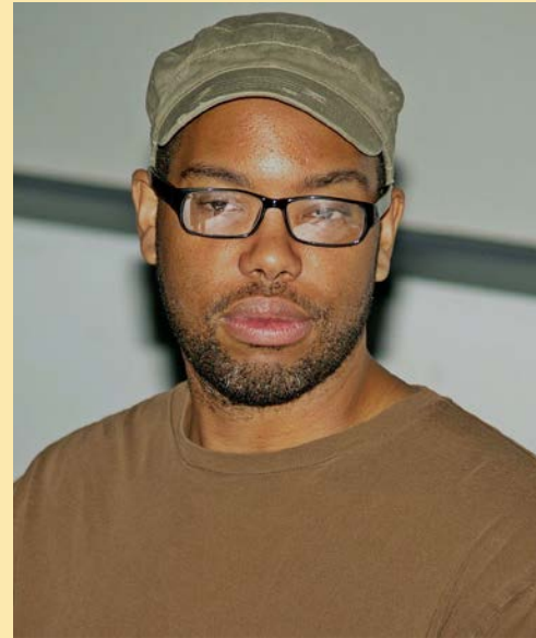
Photo by David Shankbone, Brooklyn Book Fair, 2010, Creative Commons license