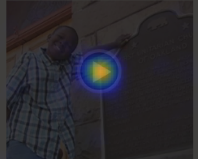
"Voices of a Liberal Faith": An Introduction to Unitarian Universalism