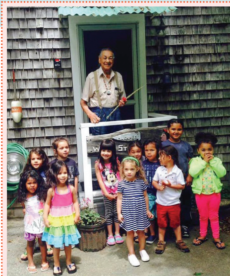
Some children are learning to speak the Wôpanâak language of their ancestors and celebrate their Indigenous culture in school.

To learn more about WLRP, visit www.wlrp.org . You can find the film online at https://www.makepeaceproductions.com/wampfilm.html .