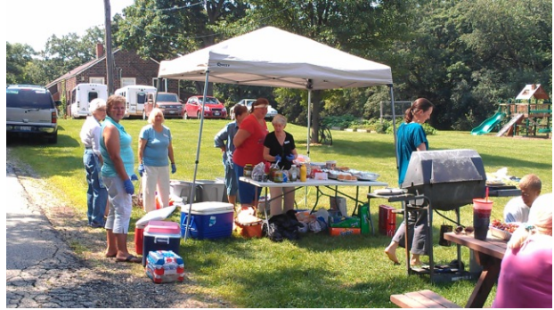
Every lunch setup includes a tent, serving tables, and a grill to cook hot food. Compassion 4 Campers serves lunch every Monday - no matter what the weather - from May 1st to September 30th