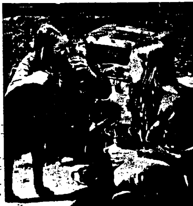
At the Ridgewood, NJ JAF conference, Spring, 1978

This winter the LRY Board of Directors shall be meeting at the All Souls UU Church in Kansas City, Missouri from December 26-31. Keep in touch with the representative from your area and make sure your concerns are represented at these meetings. Continental liaisons shall be receiving their Board packets very soon. If there is not an active federation in your area or you are just plain interested, consider attending Winter Boards. The cost of attendance for visitors shall be $15 pre-registered, $17 at the door. To pre-register write to: LRY, 25 Beacon Street, Boston, MA 02108.