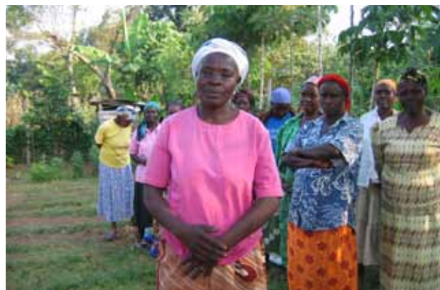
Hope in Crops photo of the women in a small community in Kenya who are in the program.