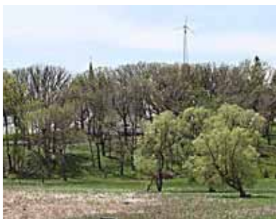
Nora Church Turbine on May 2011.

Prairie Star District The Nora Church in Hanska, MN , has erected a wind turbine; electricity will flow back onto the grid when it's in abundant supply. The First Unitarian Church of Omaha invited other UU congregations to participate in a spring Scavenger Hunt for recycling. At the Bismarck-Mandan UU Fellowship , a member organized an evening of video clips, her music and discussion around the impact of oil and gas exploration in the Bakken Shale region in northwestern North Dakota.