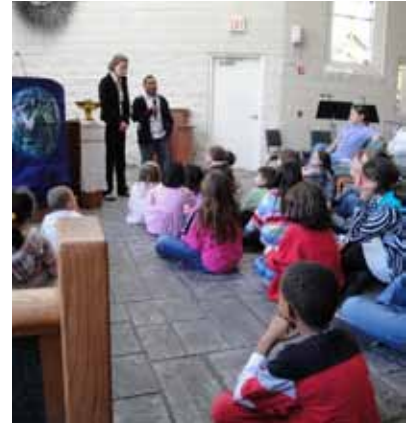
A representative from the Coalition of Immokalee shares a story for all ages at Earth Day Service at the First UU Church in Orlando.

UUMFE, UUA Washington Office for Advocacy, UU Service Committee, UU United Nations Office, and the UU State Advocacy Networks were instrumental. The International Day of Climate Action , organized by 350.org , was a worldwide initiative comprised of more than 2,000 events in over 140 nations. The UUMFE and UUA endorsed the 350.org campaign, which is dedicated to creating an equitable global climate treaty that lowers carbon dioxide below 350 parts per million. More than 100 congregations participated. UU Ministers Rev. Fred Small and Rev. Jim Scott composed and arranged a song for the campaign, " Three-Five-Oh ," complete with music video, featured on 350.org's website, and heard and sung by congregations and others across the country and around the world.