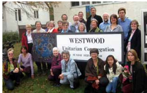
Westwood Unitarian Universalist Congregation members pose for a picture on the 10/10/10 Global Work Party day.

On October 10, 2010, UUs across the country participated in the 10/10/10 Global Work Party . Coordinated by 350.org, this was an international grassroots initiative encouraging politicians to take action against global warming. More than 7,000 events were held in 188 countries. With encouragement from the UUMFE, 89 UUA congregations and two UU statewide networks supported the 10/10/10 Global Work Party.