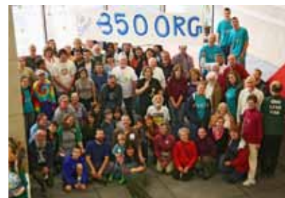
UU Church of Binghamton, NY celebrates 350.org.