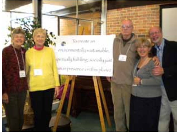
Organizers for the Awakening the Dreamer Symposium section of the Northern New England District Environmental Sustainability and Justice Conference.

This innovative, values-based curriculum will involve individual congregants and UU leaders in a highly experiential process, designed to reach people at multiple levels (intellectual, emotional, kinesthetic, practical) in order to stimulate whole-systems thinking, increased appreciation of one's interdependence with all of Creation, deepened ethical and spiritual discernment, personal behavioral change, and collective congregational advocacy. It will be one of the first national curricula of any faith tradition to deeply link anti-racism/anti-oppression training with environmental theology, spirituality, ethics and advocacy. The first module has been piloted, and the full development of the curriculum is pending funding.