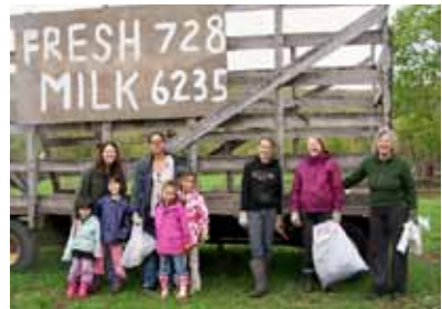
UU Congregation at Rock Tavern participated in wetlands cleanup at last remaining dairy farm in the community.