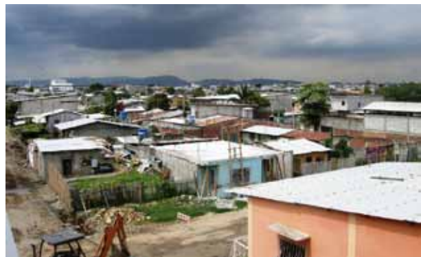
Blue Water tanks on tops of houses with out running water in Guayaquil.