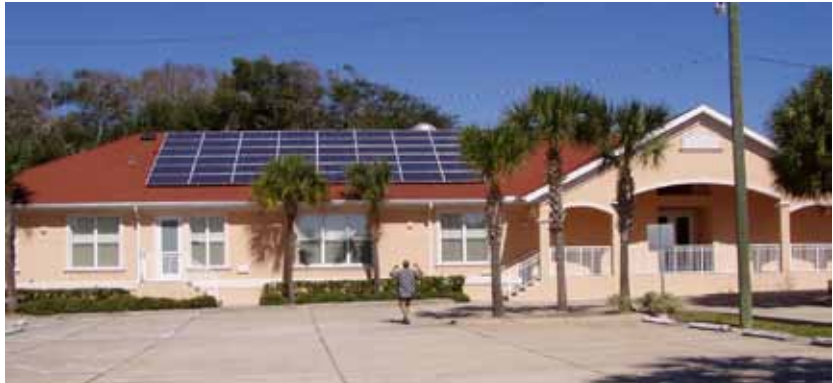
UU Society of Daytona Beach Area sanctuary with solar panels.