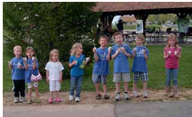
Young people at Harmony UU Church in Ohio planted seedlings in an Earth Day celebration

In 2010, the focus of Earth Day celebrations was Ethical Eating . Congregations celebrated food and food justice in worship and activities following