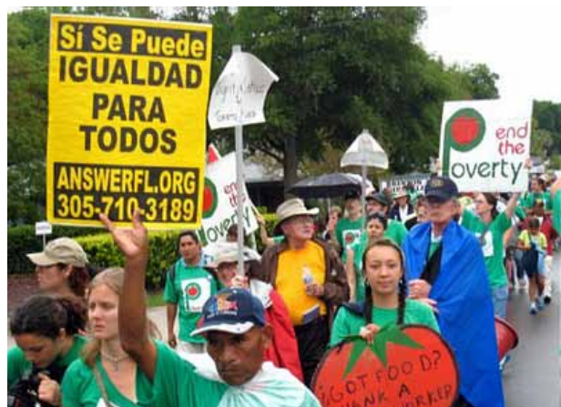
First Unitarian Church of Orlando participate in CIW picket and rally.

At the UU Fellowship of Charlotte County , the Garden Group, a crew of five friends of the congregation and one member faithfully give at least