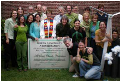
All Souls Church, Unitarian in Washington, DC celebrates accreditation with a jumbo Green Sanctuary certificate.

(Please send an electronic version of your application to uua_greensanctuary@uua.org or Rnelson@uua.org whenever your application is ready. Turn-around time for applications is approximately one month.)