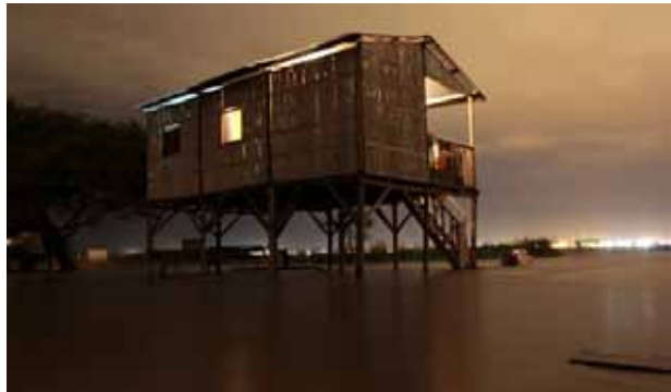
The Isla Santay, the houses of the fisher people, looking across the Guayas River to the port at Guayaquil, Ecuador by Arturo Morales