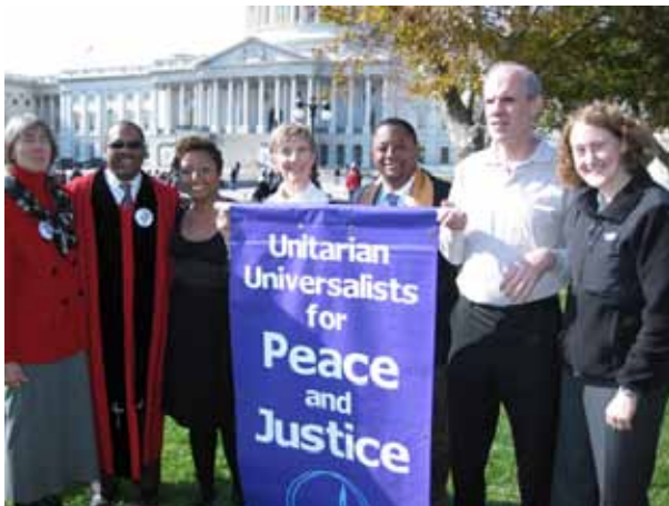
UU Ministers and Lay Leaders attend Climate Witness at the US Capitol

The UUA and UUMFE have signed onto hundreds of letters sent to the US President, Congress, and governmental agency secretaries (including the Environmental Protection Agency), reflecting the values